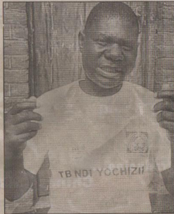
Kumpama: TB is treatable